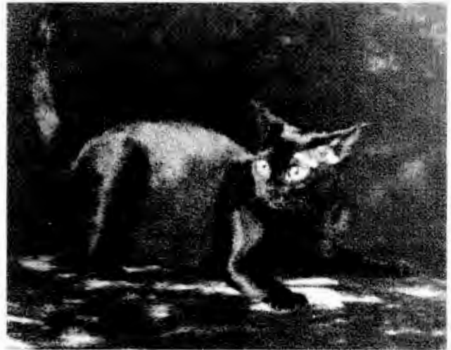
GRC, CH Road to Fame's Mabel Black Label, female Bombay. Br/Ow: Herb & Suzanne Zwecker. CFA's 10th Best Cat 1982-83.

Tracing the development of the breed reads much like a list of biblical "begats," but it all started with a few