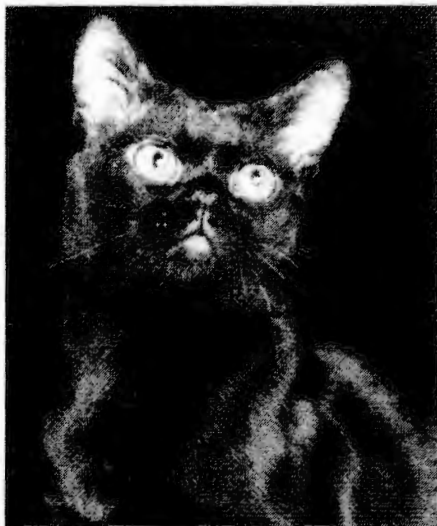
GRC, NW Road To Fame Moagley of Sultan's Pad, male Bombay. Br: Herb & Suzanne Zwecker. Ow: Shirley Marcus. CFA's Best Bombay and 11th Best Cat 1988-89.

In May, 1976, when Bombays were accepted to championship status, the Burmese and Bombay standards were very similar. Each required a pleasing round head without flat planes; a full face that tapered to a short, well-developed muzzle; a visible nose break in profile;