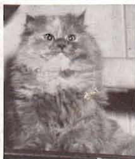
Ch. Wycliffe Marguerite 1948 AA & AW Bl. Cr. Female

nard of Raby Castle, Darlington. The Warren imports are of an entirely new bloodline, and will serve as an outcross for those Abys now owned by the Bellflower breeder. The cats arrived by trans-Atlantic plane complete with International Pedigree Certificate issued by the GCCF, thus allowing free entry into the United States without payment of Customs duty.