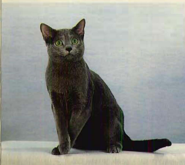
Champion Tsar Blu's Vladimir of Hono Hono

though numbers are still quite small (619 were registered with the CFA in 1998), the breed has a strong following and does well in national and regional shows. The relatively small group of American Russian Blue breeders is close-knit and possessive of their breed. "Most reputable