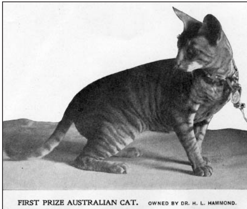
From "Concerning Cats" (USA) 1890 ("Tricksey").

The following courtesy of Sarah Hartwell (UK):