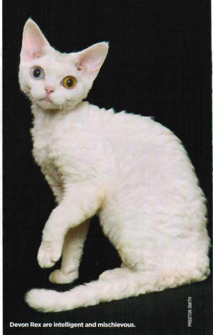
Devon Rex are intelligent and mischievous.